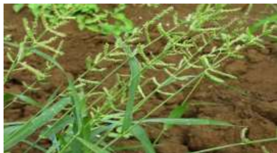
Fig. 1: Echinochloa Colona .

Domain: Eukaryota. Kingdom: Plantae Phylum: Spermatophyta Subphylum: Angiospermae. Class: Monocotyledonae Order: Cyperales Family: Poaceae Genus: Echinochloa Species: Echinochloa Colona .