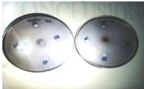
Fig 7: Petri Plates showing anti-microbial activity of silver Nano particles.