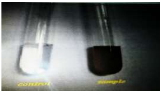
Fig 3: A Visible observation of change in color during silver nano particles formation.