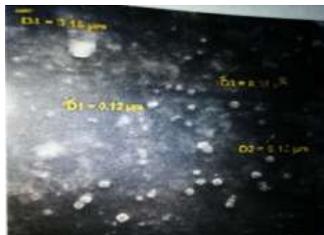
Fig 6: SEM micrographs of synthesized silver Nano particles using the Echinochloa colona extract.

(Figure7) Synthesized Ag NPs exhibited effective antimicrobial activity against pathogenic Bacillus and E. Coli species. Leaf extract has not shown any inhibition, where as Ag NPs shown inhibition towards both Bacillus and E. Coli species. The zone of inhibition increased as the concentration of Ag NPs increased from 10 to 30\mu\text{L} . This clearly indicates that the antimicrobial activity is due to Ag NPs. The exact mechanism for the anti-microbial activity of Ag NPs is not yet known, but hypothetically, many studies reported that the Ag NPs could bind to the bacterial membrane, invade the cell and cause dissipation of proton motive force which leads to the disruption of bacterial cell by forming pores on the bacterial cell wall.