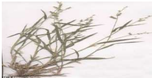
Fig. 2: Echinochloa Colona .

Echinochloa Colona is plant with annual, (Figures 1,2) with fibrous, rather shallow roots. culms stout, usually reddish-purple, erect, ascending or decumbent, often branching from the base, often rooting at the lower nodes, 20-60 cm tall, sometimes nodes conspicuously swollen and usually geniculate, compressed [4], lower internodes often exposed. sheath 3-7cm long, compressed, keeled, glabrous, ligule absent, leaf blades light green, sometimes with transverse purple bands, flat, glabrous, elongate, 4-10 cm long, 3-8mm wide, margins occasionally scabrous, 2-4cm